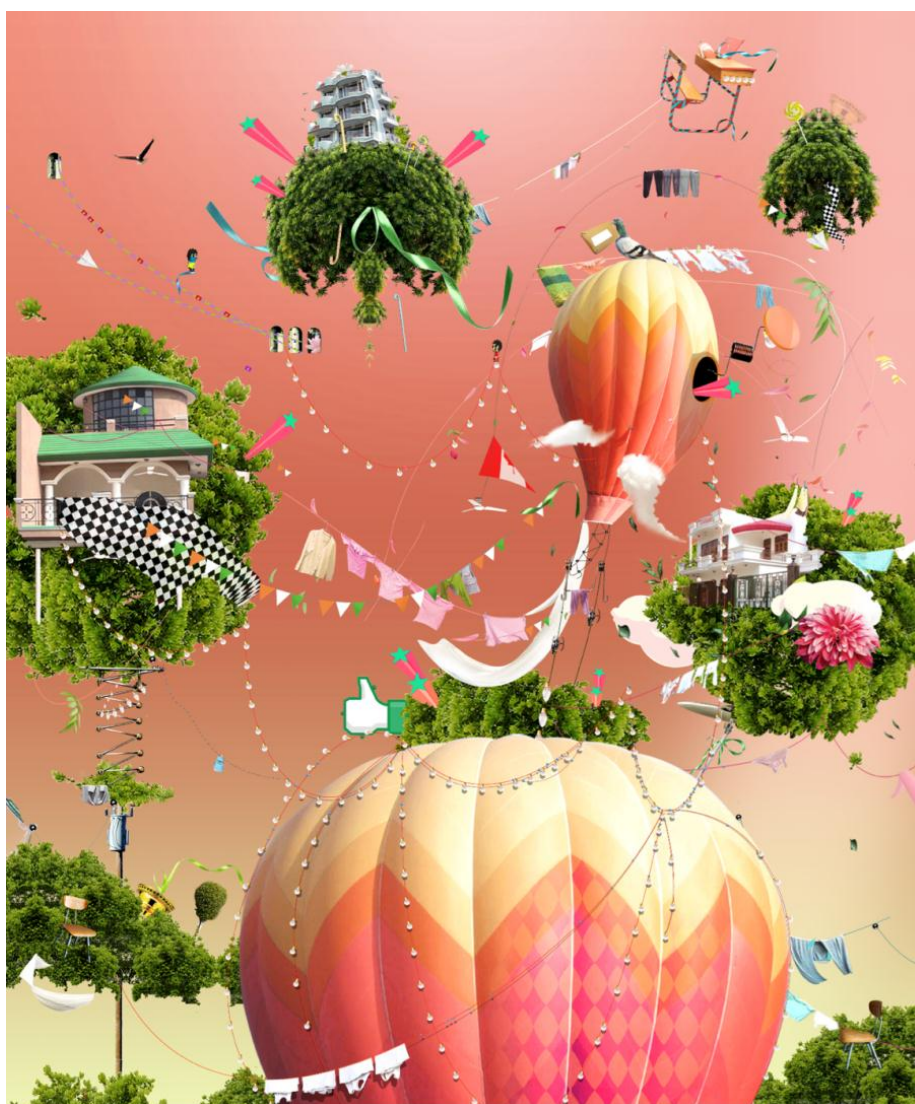
Dominus Aeris: Escape 3 2012 Oil on canvas 96 x 72 inches

Thukral and Tagra, alias “T&T”, have been collaborating since 2004 and are now widely recognized in the international contemporary art scene. Influenced by contemporary life in all its diversity, T&T boast a rich body of work in painting, sculpture, installation and product design. Their art appeals to a global audience addressing universal themes of identity, consumerism and change.