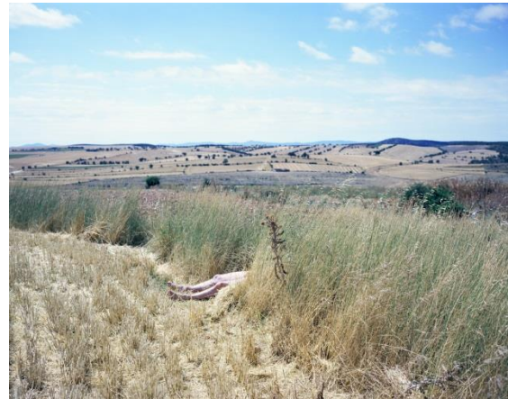
From the series Spurious Landscapes , since 2010